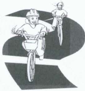
Illustration by Billy Nuñez, age 16