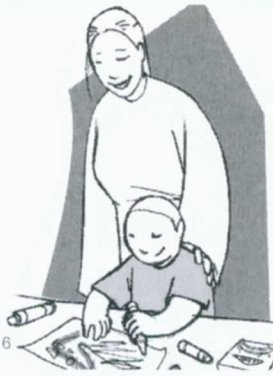
Illustration by Billy Nuñez, age 16