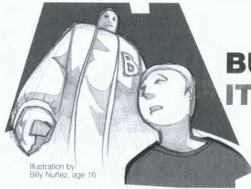
Illustration by Billy Nuñez, age 16